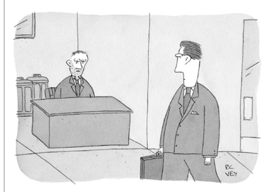
"Hey, buddy, can you spare some paperwork?"